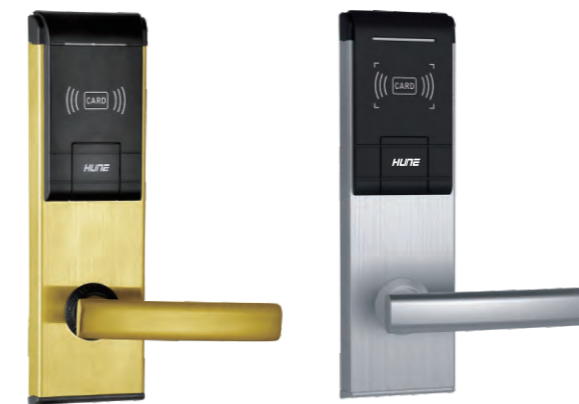
930BP-6-D Golden PVD (Plastic top and bottom)